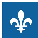
CEEC (Canada) ↗