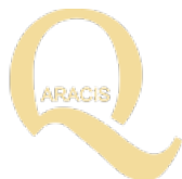
ARACIS (Roumanie) ↗